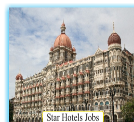
Star Hotels Jobs

Low Fees, Campus Interview Separate Hostel For Boys & Girls