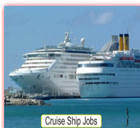
Cruise Ship Jobs