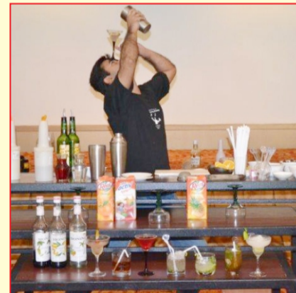
Indian Institute of Bar Tending Chennai IIBT Team