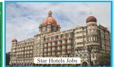
Star Hotels Jobs