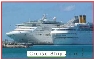
Cruise Ship Jobs