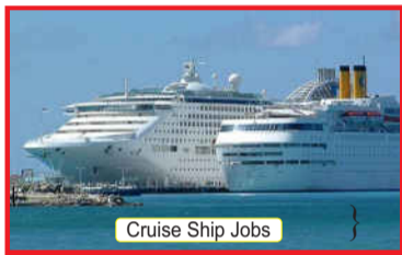
Cruise Ship Jobs