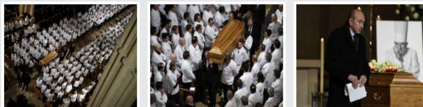
Hundreds of chefs from around the world, all in chef whites, attended Paul Bocuse's funeral in Lyon, City of France

Legendary French chef Paul Bocuse, often referred to as the "POPE OF FRENCH CUISINE", died aged 91 on 20 January. 2018