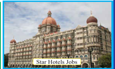
Star Hotels Jobs