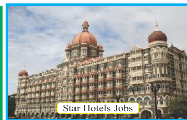
Star Hotels Jobs

Low Fees, Campus Interview Separate Hostel For Boys & Girls