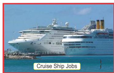
Cruise Ship Jobs