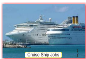
Cruise Ship Jobs