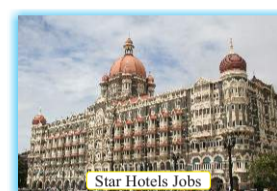
Star Hotels Jobs

Low Fees, Campus Interview Separate Hostel For Boys & Girls