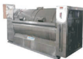
Horizontal washing machine