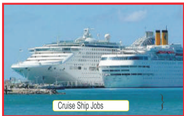
Cruise Ship Jobs