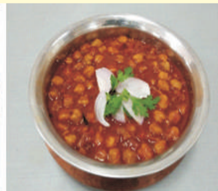
Chana Masala is traditionally based with green chillies, onion, garlic, coriander leaves, coriander powder, cumin seeds, cardamom, cinnamon, peppercorns, cloves, turmeric, red chillies, dried mango powder tomatoes and cooked