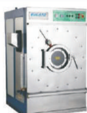
Vertical washing machine