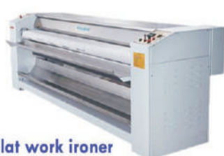
Flat work ironer