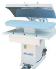
Flat bed press