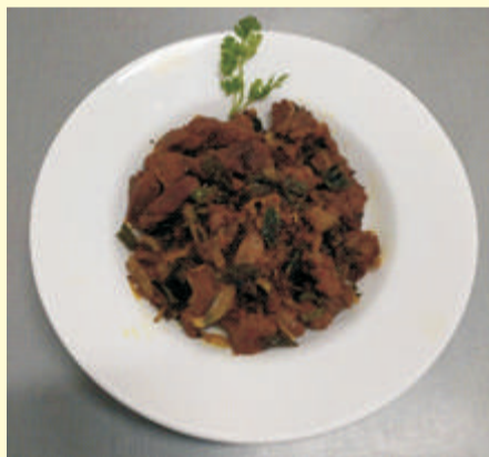
Mutton Pepper Fry is traditionally made by combining pieces of mutton with onions, garlic, curry leaves, green chillies, coriander powder, cumin powder, pepper corns, turmeric, red chillies and fennel.