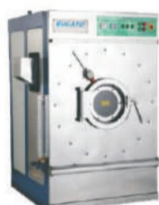
Vertical washing machine