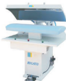
Flat bed press