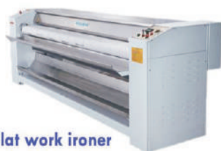
Flat work ironer