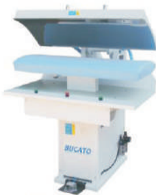
Flat bed press