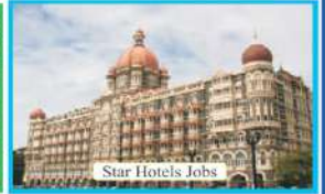
Star Hotels Jobs