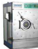
Vertical washing machine