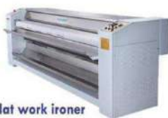
Flat work ironer