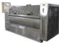
Horizontal washing machine