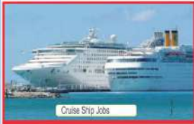
Cruise Ship Jobs

www.hotelierstalk.com www.annamal.edu.in Email : ediamal@yahoo.com Contact: 98401 30070