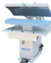
Flat bed press