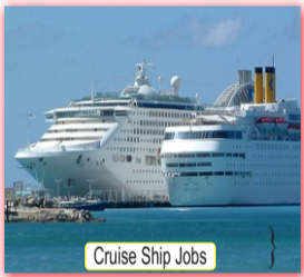
Cruise Ship Jobs