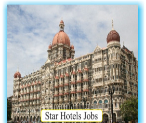
Star Hotels Jobs

Low Fees, Campus Interview Separate Hostel For Boys & Girls