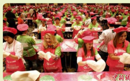
Photo: The Guinness World Records world record for largest number of pizzas simultaneously tossed was broken at an event in Shanghai. A total of 511 pizzas were tossed.

SHANGHAI, China -- Staff and members of a breast cancer association More Than Aware (MTA) were seen simultaneously stretching and tossing the dough at the Pudong Shangri-La hotel; the 511 participants, most of whom were cancer survivors, needed to continue for a minimum of one minute, thus setting the new world record for the most people tossing pizza dough, according to the World Record Academy.