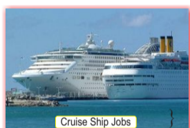
Cruise Ship Jobs